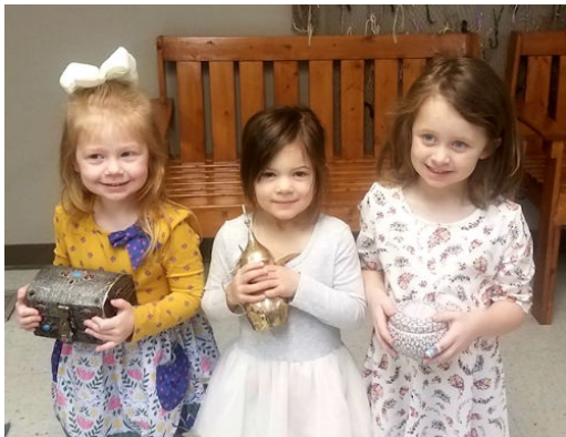
Pictured: 3 "wise" girls!